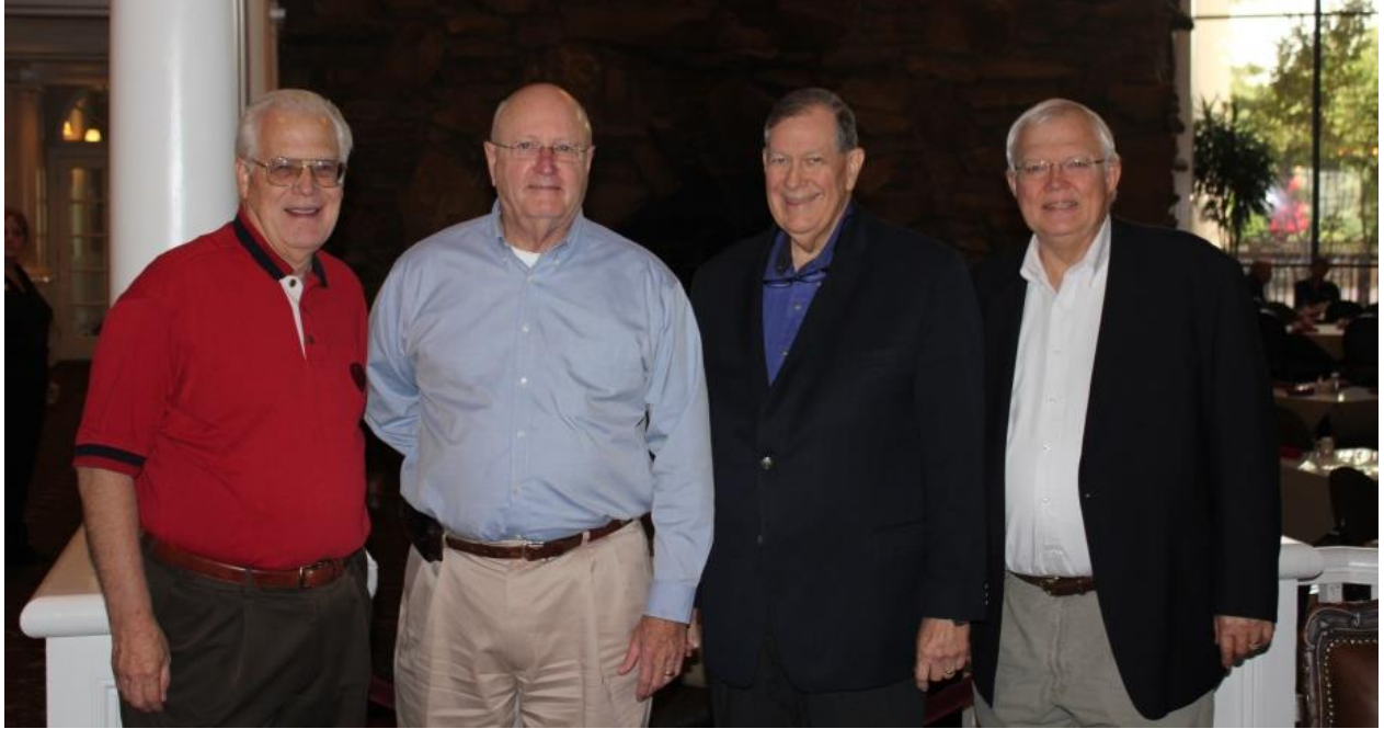
2014 ALAGD Delegation at the 2014 AGD Annual Meeting in Detroit.