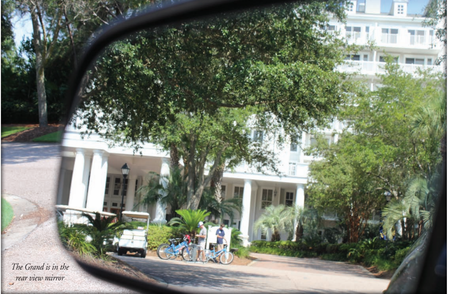
The Grand is in the rear view mirror