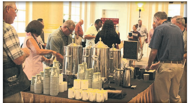
Always a popular spot at break time during lectures!