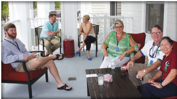
Lunch time on the veranda.