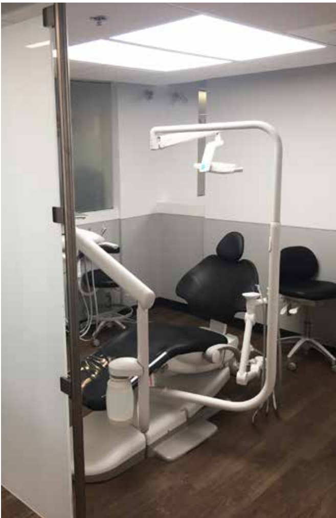
The new operator at the UAB dental clinic