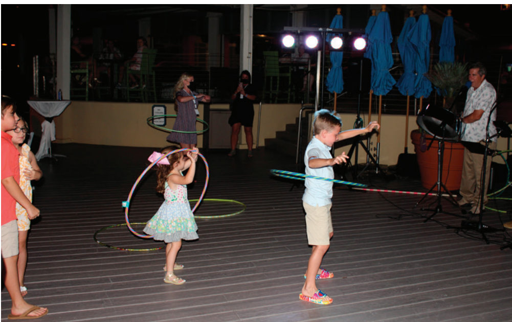
The kids having fun at the deck reception trying out the hula hoop expertise