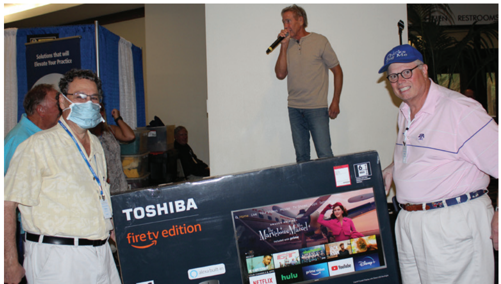
The big winner ! Large screen TV